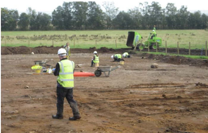
Advance Archaeological Investigation Works

A two phase procurement strategy has been adopted for this project, encompassing a design development phase and a construction phase. The first phase, a contract to develop the detailed design and a Target Cost to carry out the works was awarded on 1 May 2015 to a GRAHAM/Farrans JV. This Phase 1 development work continues with some site clearance activities and detailed design advancing with geotechnical and structural approvals being progressed.