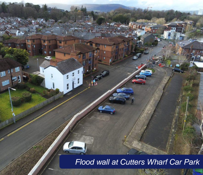
Flood wall at Cutters Wharf Car Park

Works across the entrance to the Cutters Wharf Car park have been completed and reinstated allowing this access to the carpark to be reopened.