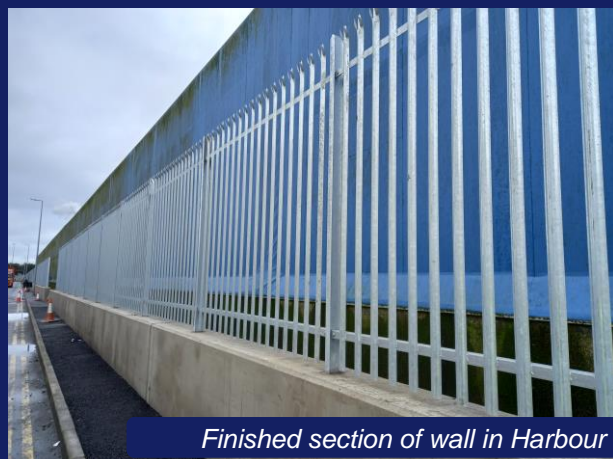
Finished section of wall in Harbour

Wall construction in the commercial area of the harbour is fair finished concrete in keeping with the surrounding commercial environment. Walls are topped with security fencing. Works are progressing well and are expected to take a further 6 months to complete. Access to the harbour is restricted.