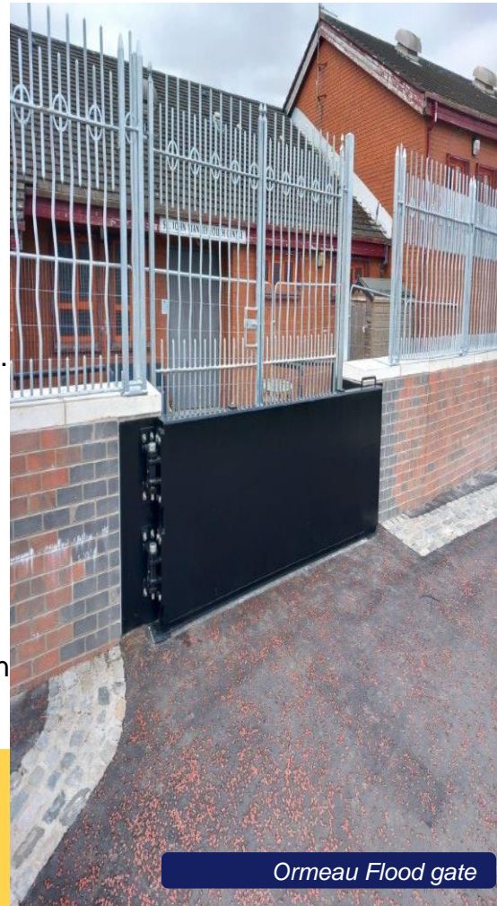
Ormeau Flood gate

Phase 2 of the works has commenced and is progressing well with around 200m of this 400m section between River Terrace and Allstate complete. To reduce the inconvenience that this closure may cause we have accelerated these works. This means that this section of the towpath will be reopened approximately 1 month earlier than originally planned. Phase 3 is due to start later this month. A local closure of the towpath will remain between Allstate and the Albert Bridge until the entire section is complete. Construction traffic will access this section from Eastbridge Street and a banks person will be on site to manage traffic.