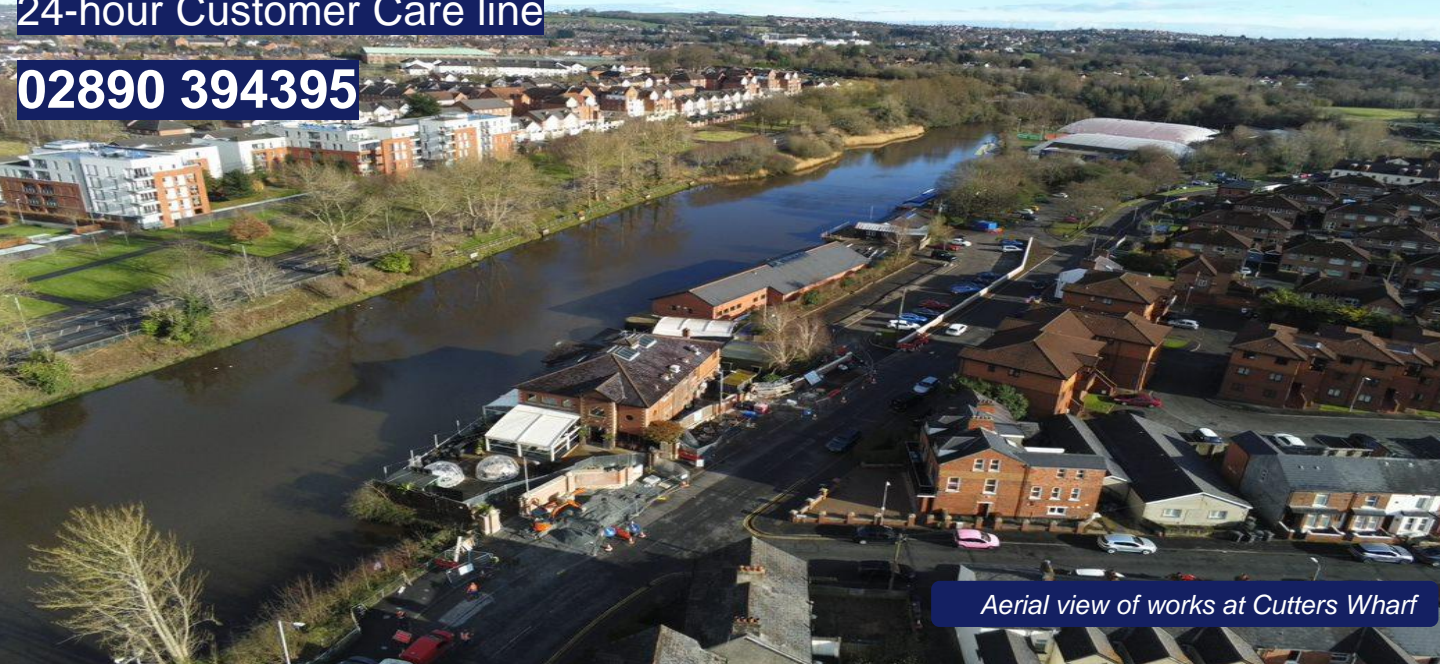
Aerial view of works at Cutters Wharf