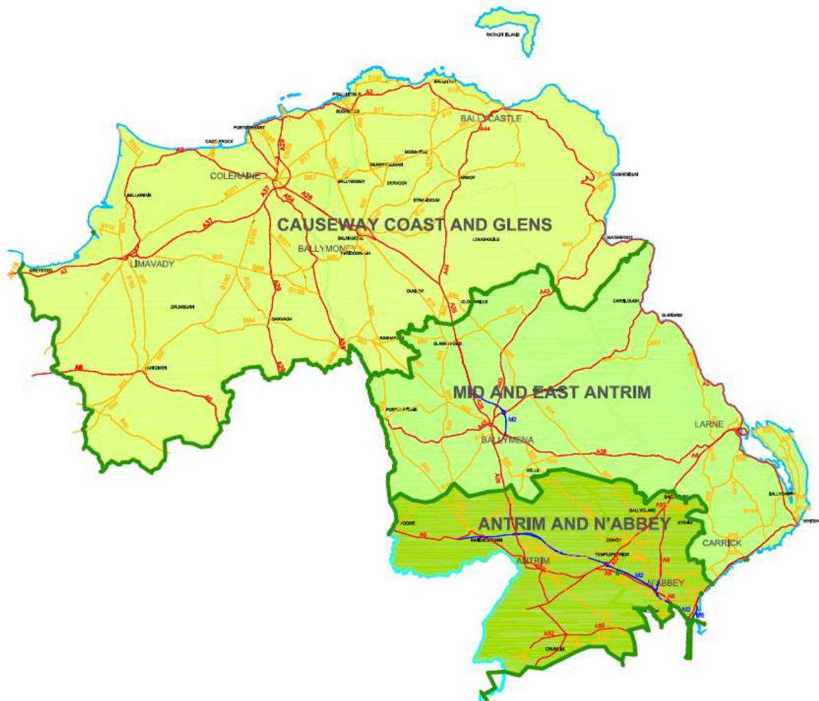
TABLE 1: Division Details

Northern Division is responsible for approximately 5,853km (3,635 miles) of public road and 2,636km of footway, together with 1,364 bridges and 10 park and ride/share sites. We carry out functions under the headings: