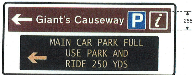
DIAGRAM A - FACE 2

Junction ahead sign indicating direction to the main Giant's Causeway car park incorporating a VMS showing the number of spaces available