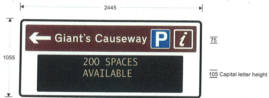
DIAGRAM A - FACE 1

Junction ahead sign indicating direction to the main Giant's Causeway car park incorporating a VMS showing the number of spaces available