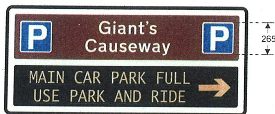
DIAGRAM B - FACE 2

Sign incorporating VMS indicating the number of spaces available in main Giant's Causeway car park