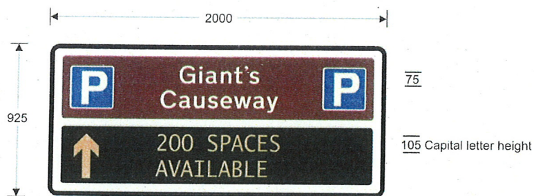
DIAGRAM B - FACE 1

Junction ahead sign incorporating a VMS indicating that main Giant's Causeway car park is full and the direction to a Park and Ride site