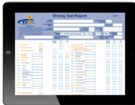
Example of the Driving Examiner's mobile device

We are also in the process of developing a mobile application to be used on a tablet device, by driving examiners as part of the driver test process.