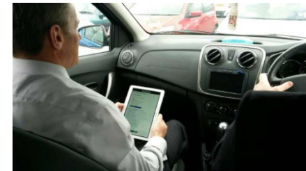
The trialling of the Driving Examiner's mobile device

Work is underway to put the necessary infrastructure in place to facilitate this change to the way we work. Over the next few months we aim to trial these mobile devices firstly in house with our driving examiners at three pilot sites (Coleraine, Dill Road and Belfast Test Centres).